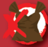
Low Cut Blouses